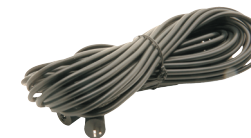
Sofa loop cable