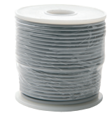
Room loop cable with clips